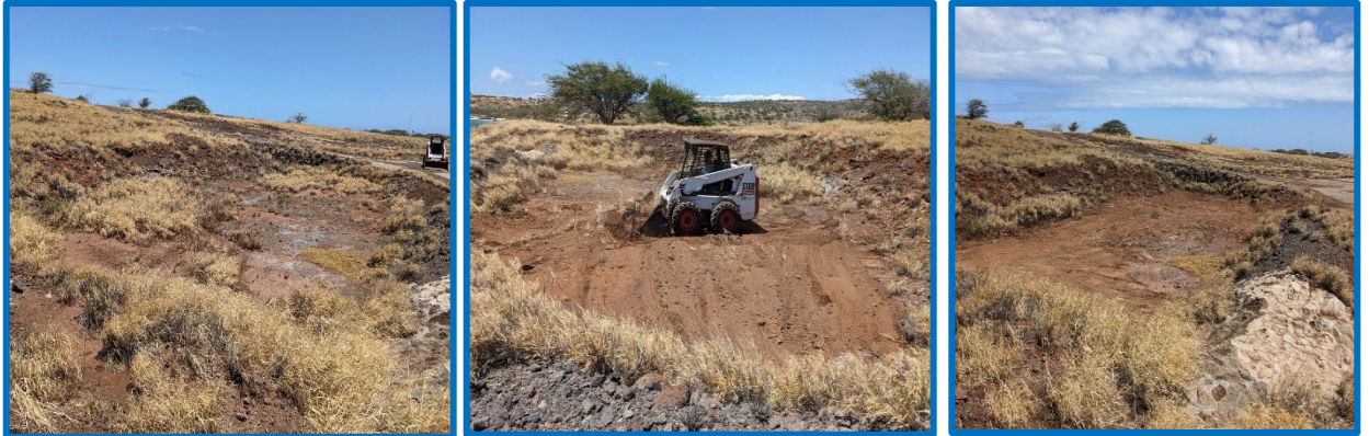
Photos above: Honokanai'a silt pond clearance: before, during and after.