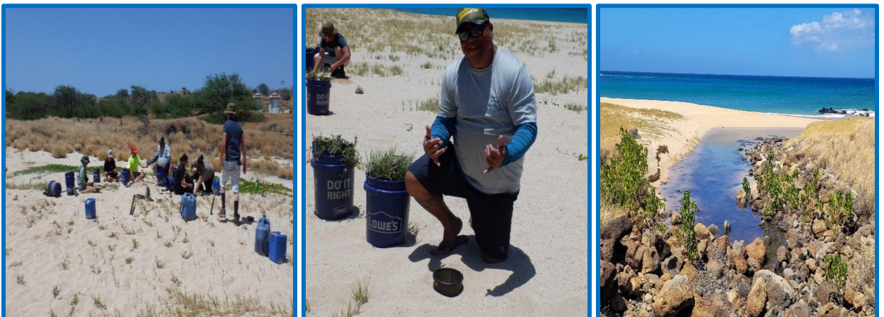
Photos Above: Native planting with volunteers continues in the Honokanai'a wetland area.